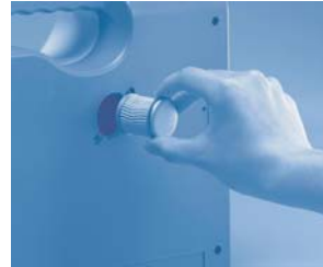
Large Air Filter Intake