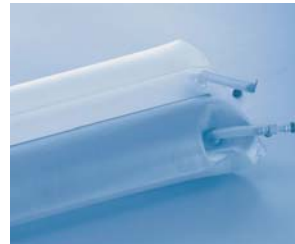
Patented Cell-in-Cell bladder's design