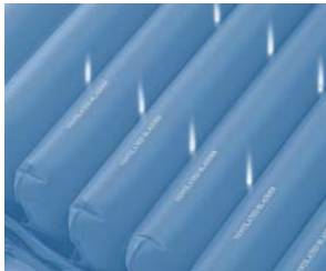
Air Bladders with Low Air Loss